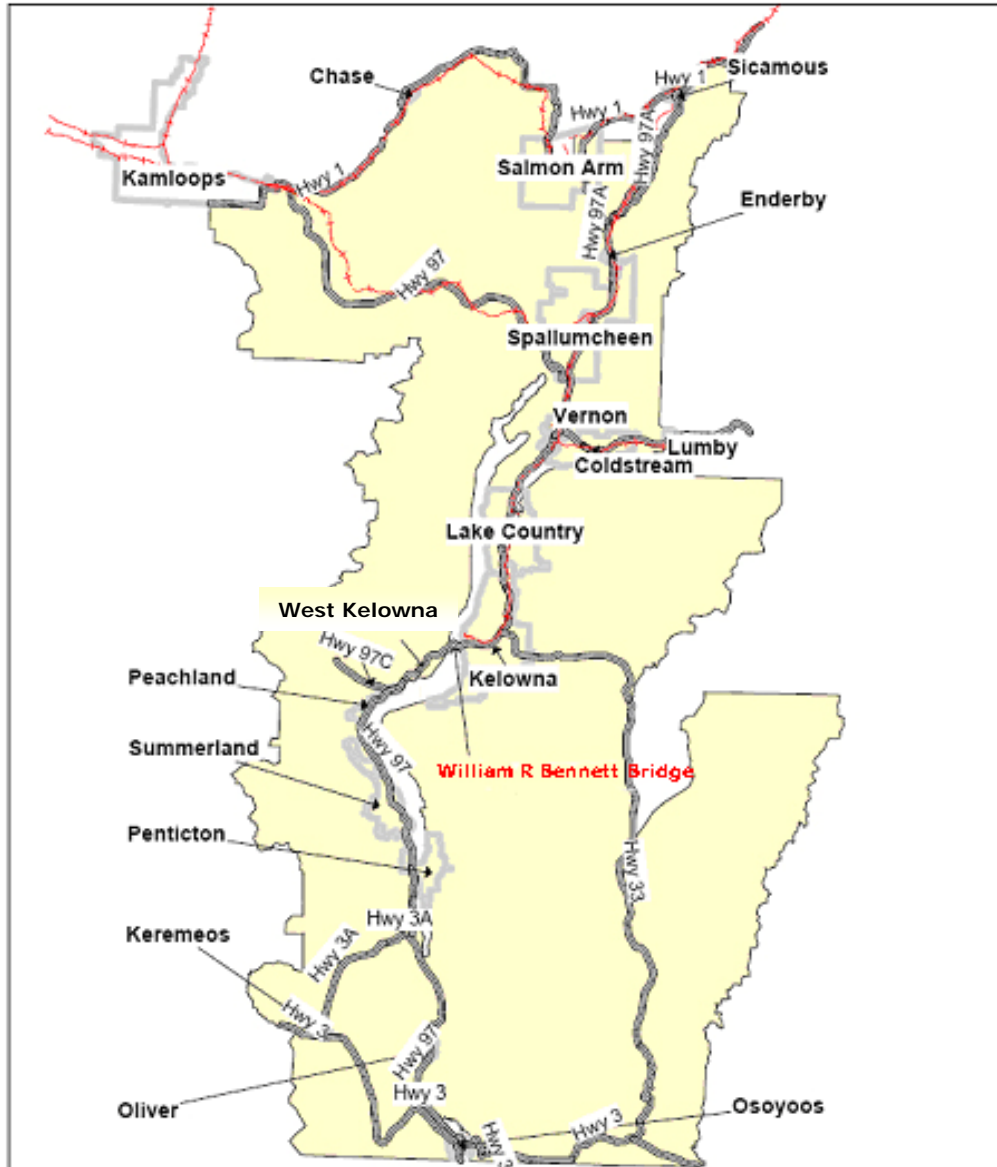
Okanagan Valley Road Network Map

Highway 97 is the Okanagan Valley's key north-south highway with connections to several east-west highways, including the Trans Canada Highway and Highways 3 (Crowsnest or Southern Trans Provincial Highway), 3A, 6 and 97C (Okanagan Connector). Highways 97A, 97B and 33 are north-south routes that parallel various sections along the Highway 97 spine. However, none of these routes provides a continuous connection between the communities in the north and the south.